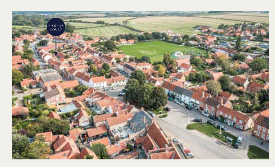
A rare opportunity, nestled in the very heart of Burnham Market